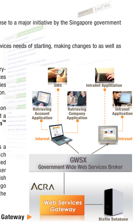
ACRA Web Services Gateway ▶

The ACRA Web Services Gateway (ACRA WSG) is designed and implemented as a single, secure query engine and gateway for online business filing system which connects to the Government Web Services Exchange (GWS-Exchange) spearheaded by the Infocomm Development Authority of Singapore (IDA). The exchange, a broker for government Web Services, will allow government agencies to deploy and publish Web Services. For example, a service request from a public sector agency will go through the exchange and once it is verified, the ACRA system will pass back the service that is requested.